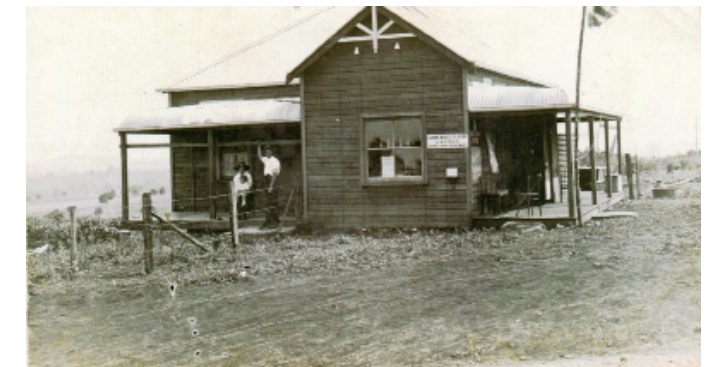
An early Wollongbar Post Office