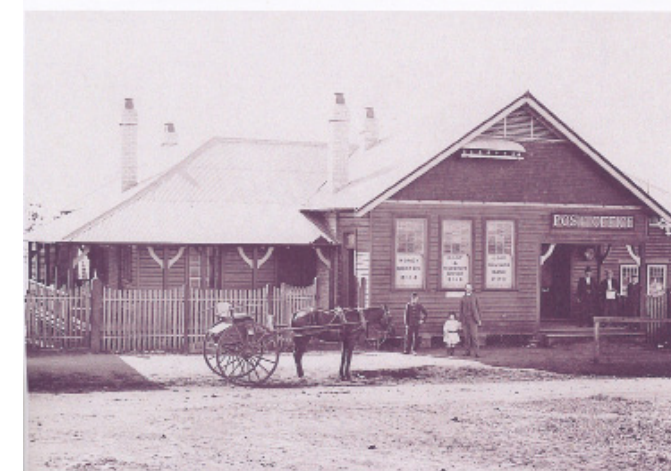
Alstonville's second Post Office around 1902