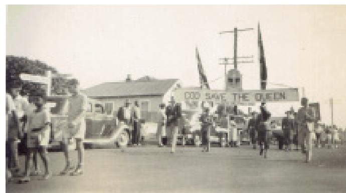
Coronation day parade 1953