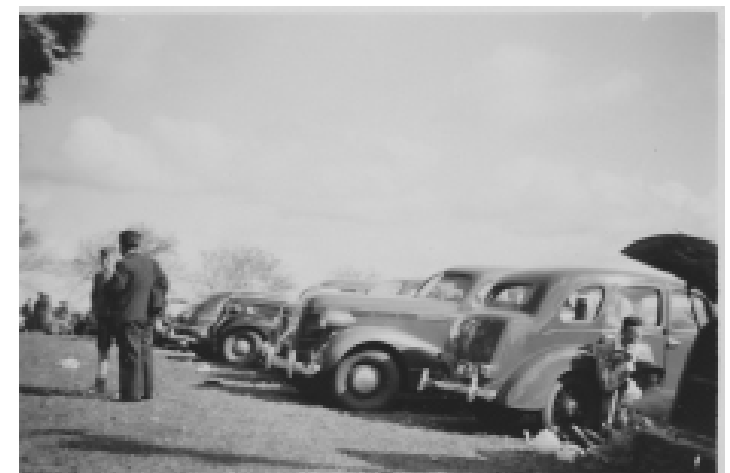
Wollongbar field day note Cyril having a picnic with tea pot?

Scenes from what Elsie says "is a creek a short distance from Sheroo's (presumably at Uralba)"