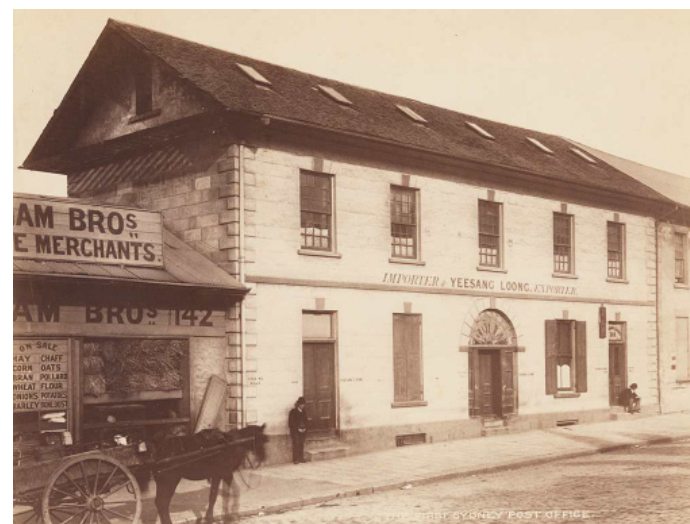
The first Sydney post office.

But sending a letter overseas was a mixture of luck and resolve. The sender would need to wait for a departing ship, give the letter to the ship's captain with no guarantees that it would be delivered.