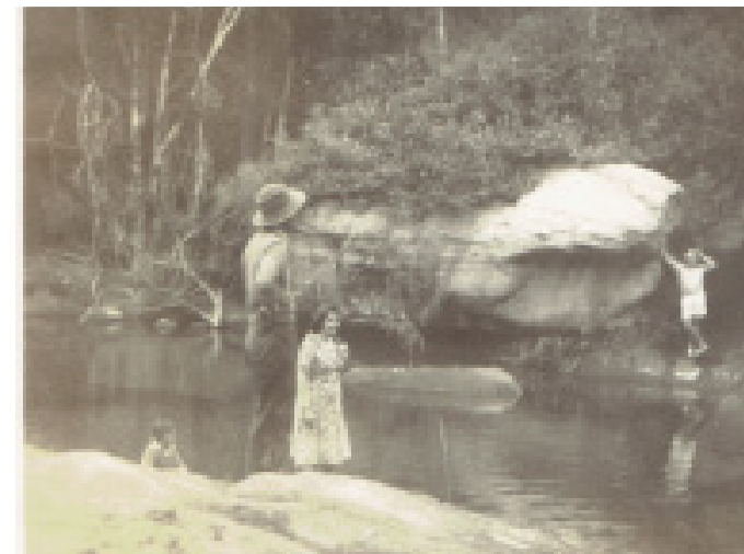
Creek down stream from Sheroos